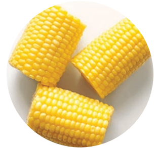
Corn On The Cob