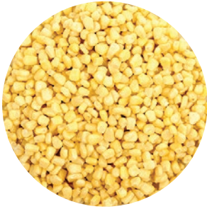
Supersweet White Whole Kernel Corn