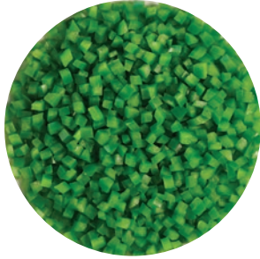
Diced Green Peppers

10055686720046 6 x 2 lb 10055686720053 1 x 20 lb