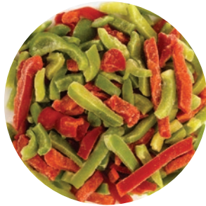
Red and Green Pepper Strips