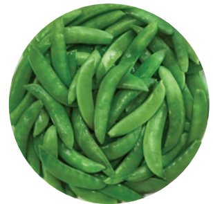
Sugar Snap Peas