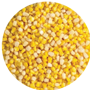
Peaches and Cream Corn

10055686700758 12 x 2 lb 10055686700857 1 x 20 lb