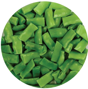
Cut Italian Beans

10055686 010918 12 x 2 lb 10055686 010925 1 x 20 lb