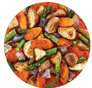
Roasting Vegetables Asparagus & Red Potatoes

Supersweet corn, black beans, edamame beans