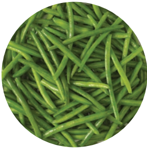
Fine Whole Green Beans