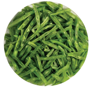
French Style Green Beans