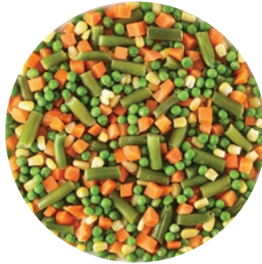
Mixed Vegetables (4)

Crinkle sliced carrots, cauliflower florets, quartered zucchini, romano beans, baby lima beans