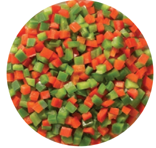
Diced Red and Green Peppers

Diced carrots, diced celery, diced onions