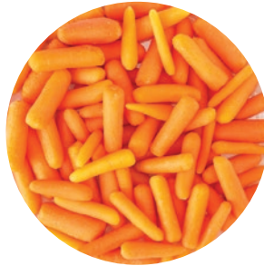
Whole Baby Carrots

10055686930735 12 x 2 lb 10055686930698 1 x 20 lb