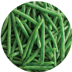
Whole Green Beans

10055686 010932 12 x 2 lb 10055686 011427 1 x 20 lb