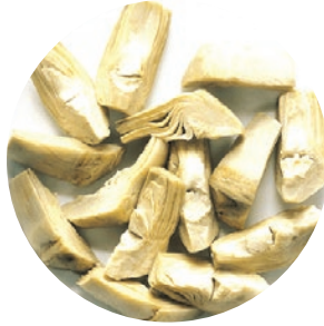
Quartered Artichoke Hearts

White great northern beans, black turtle beans, chick peas, navy beans, red kidney beans, pinto beans, black eyed peas