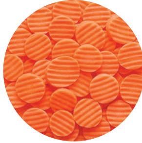
Crinkle Sliced Carrots

10055686930650 12 x 2 lb 10055686930759 1 x 20 lb