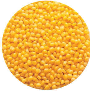
Supersweet Whole Kernel Corn