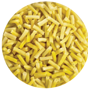
Cut Wax Beans