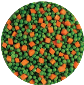
Diced Peas and Carrots

Cut green beans, medium broccoli florets, onion strips, sliced mushrooms