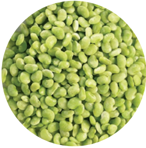
Baby Lima Beans

10055686 510128 12 x 2 lb 10055686 510098 1 x 20 lb