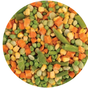
Mixed Vegetables (5)

Crinkle sliced carrots or diced carrots, cut green beans, peas, supersweet corn