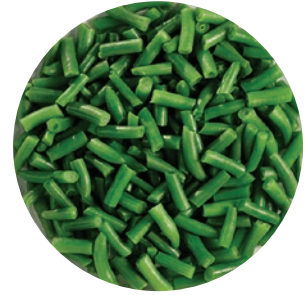
Cut Green Beans

10055686 010918 12 x 2 lb 10055686 010925 1 x 20 lb